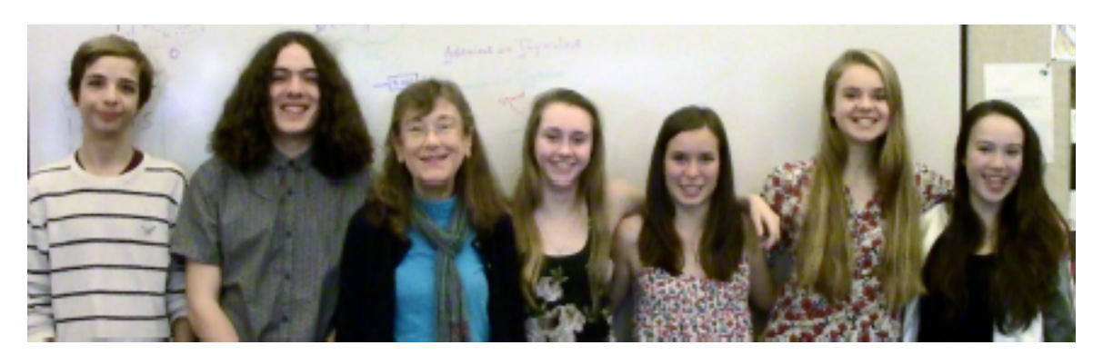
Some of the committee members

<u>The GISS WELLNESS Committee</u> is focusing on 2 initiatives this year: