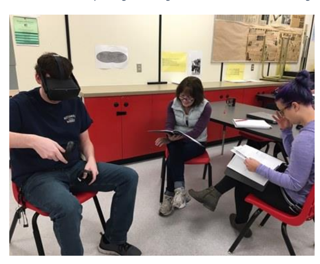
2 - Professional Development Day with teachers from Elkford Secondary School